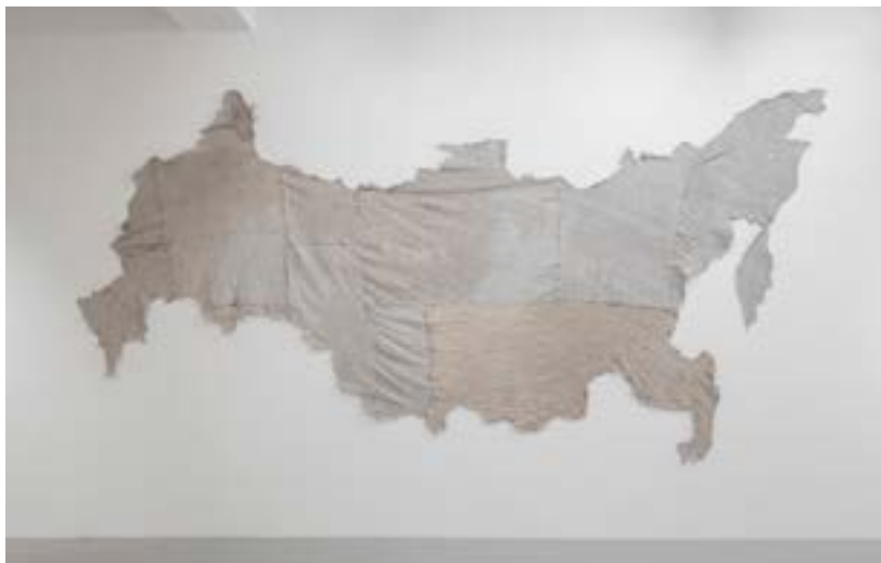
Chaim Sokol Homeland, 2011 floor cloth 400 × 200 cm

resisting totalitarianism; after all, no one was putting these authors in prison for their art, as a rule. But the specificity of cultural politics in the countries of ‘real socialism’ needs to be considered, as it was markedly different from the Western European or US contexts. Differences within Eastern Europe are, of course, very interesting from this point of view: for instance, in Yugoslavia, there was practically no censorship in the cultural sphere, while in the USSR all these activities—of Prigov, Rubinstein, Collective Actions—existed in the underground.